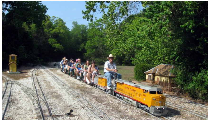
August 20, 2011, Public Run Day