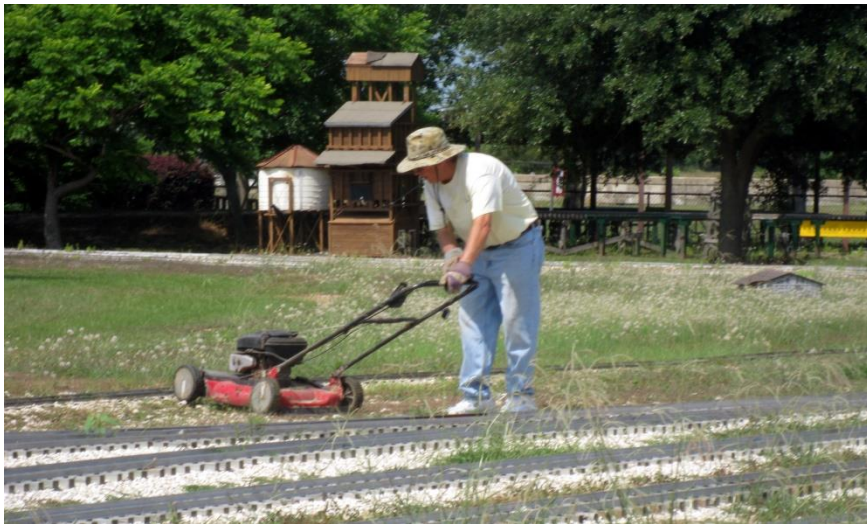
May 5, 2012, Work Day