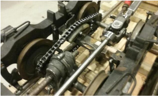
Truck all cleaned up with drive shaft laying on truck beside old gear box.