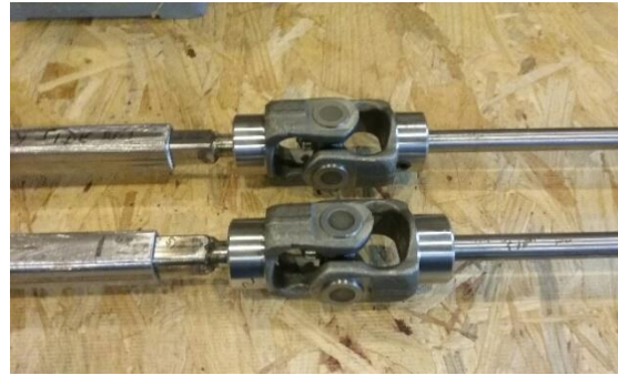
New drive shafts with universals. December 30, 2016