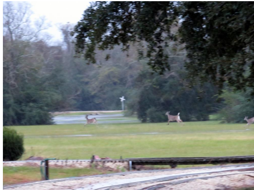
Deer running away from us humans in the station. Lots of water just past the left hand deer.