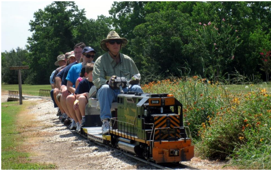
July 17, 2010, Public Run Day