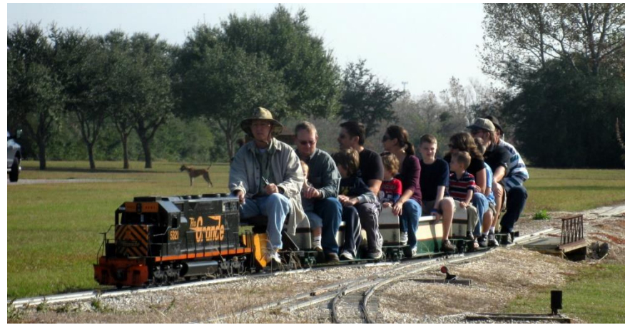
November 20, 2010, Public Run Day