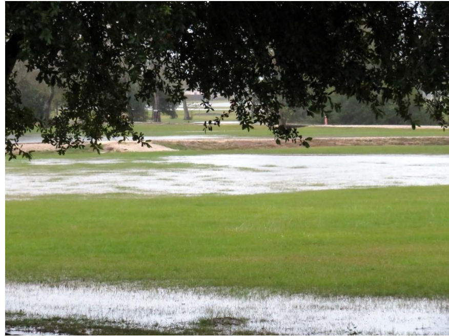
Water in the infield of Phase I.