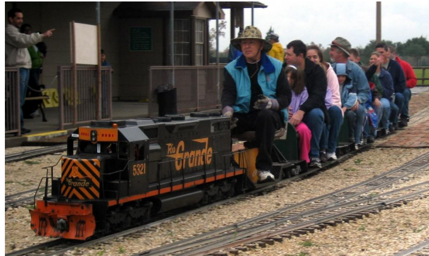
November 21, 2009, Public Run Day