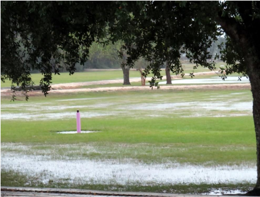
Phase I infield has the puddles.