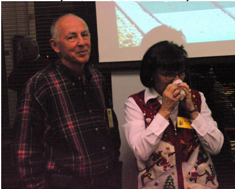
Left: December 6, 2010, Christmas Party