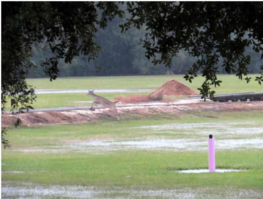
Deer crossing the track at Black's Crossing. Lots of puddles.

The rains came and the puddles formed. Lucky us, we got to see deer run across the track and away from us. The work day and meeting were cancelled.