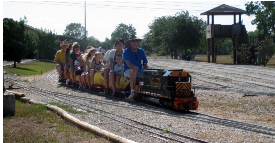
Above: June 18, 2011, Public Run Day