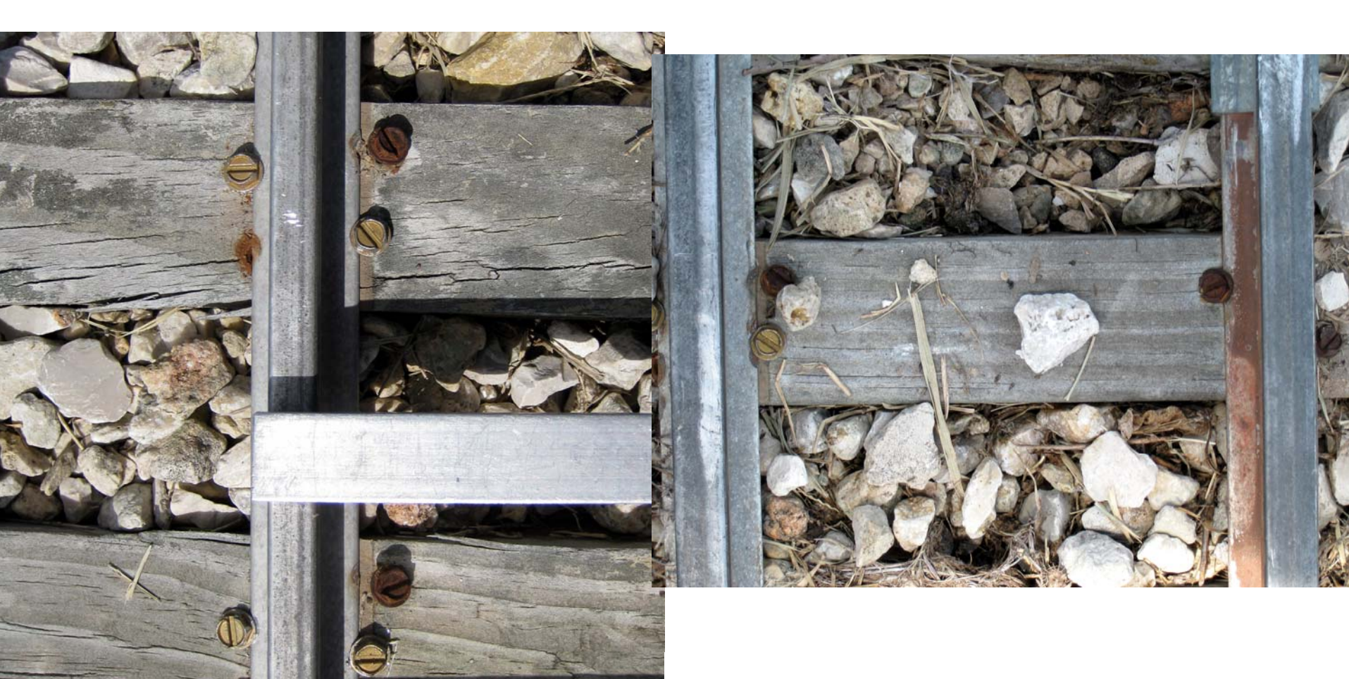
The 4.75 inch gauge track was 1/8 inch narrow. The old rusty screws mark the old, narrow, inside gauge line. The tie has a 1/8 inch strip where it was covered by the rail. The new screws mark the 4.75 inch gauge line. This is not wider than nominal which we use on the 7.5 inch gauge where we install the track at 7.56 (7 and 9/16ths inch).